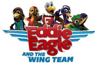
Eddie Eagle Kid's Zone Hunting Outfitter Hall