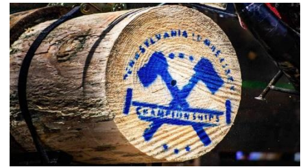
Pennsylvania Lumberjack Championships Large Arena February 3-7