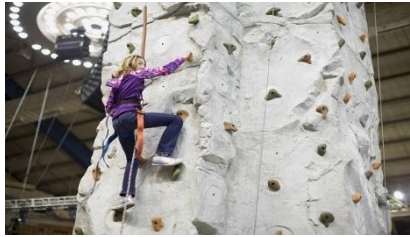
Rock Climbing Wall Large Arena February 3-7