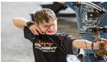
3D Bowhunter Challenge & Spot Challenge Archery Range Hall