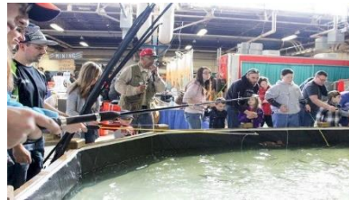
Trout Pond Fishing Hall