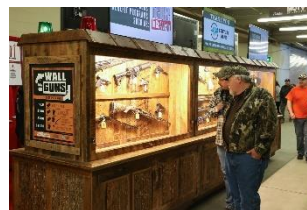
Wall Of Guns Main Hallway