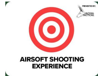
Airsoft Shooting Experience Outdoor Lifestyle Hall