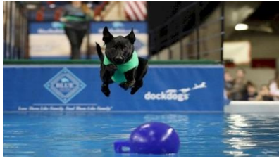
Dock Dogs Competition Large Arena February 3-7