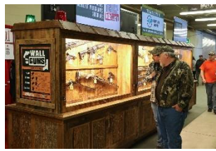
Wall Of Guns Main Hallway