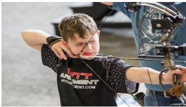
3D Bowhunter Challenge & Spot Challenge Archery Range Hall