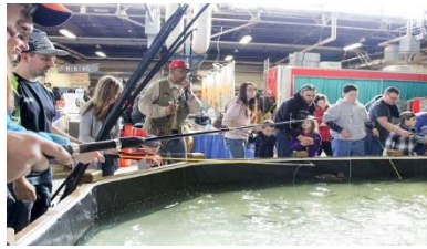
Trout Pond Fishing Hall