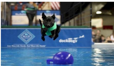
Dock Dogs Competition Large Arena February 3-7