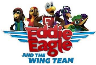
Eddie Eagle Kid's Zone Hunting Outfitter Hall