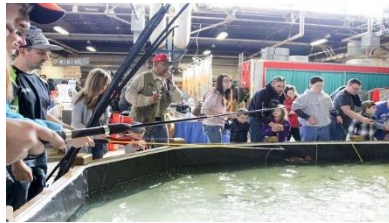
Trout Pond Fishing Hall