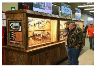
Wall Of Guns Main Hallway