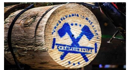
Pennsylvania Lumberjack Championships Large Arena February 3-7