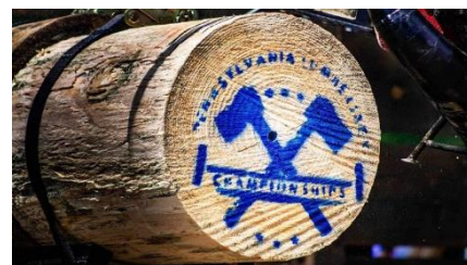
Pennsylvania Lumberjack Championships Large Arena February 3-7