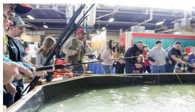
Trout Pond Fishing Hall