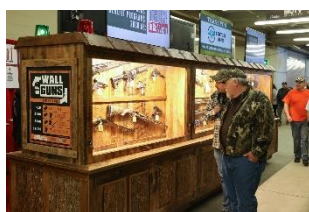
Wall Of Guns Main Hallway