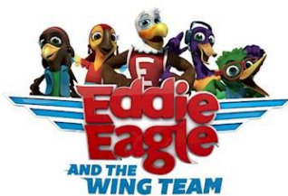
Eddie Eagle Kid's Zone Hunting Outfitter Hall