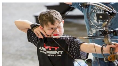
3D Bowhunter Challenge & Spot Challenge Archery Range Hall