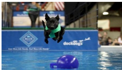
Dock Dogs Competition Large Arena February 3-7