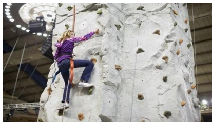
Rock Climbing Wall Large Arena February 3-7