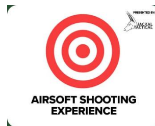
Airsoft Shooting Experience Outdoor Lifestyle Hall